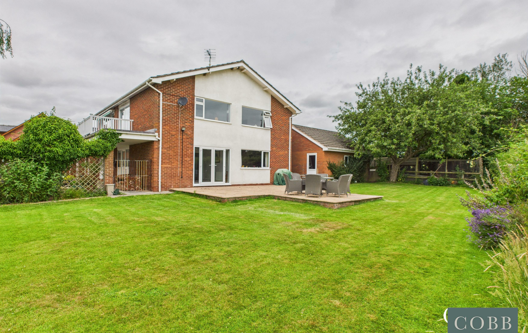
The Birches, Almeley, HR3 6LQ Price £650,000